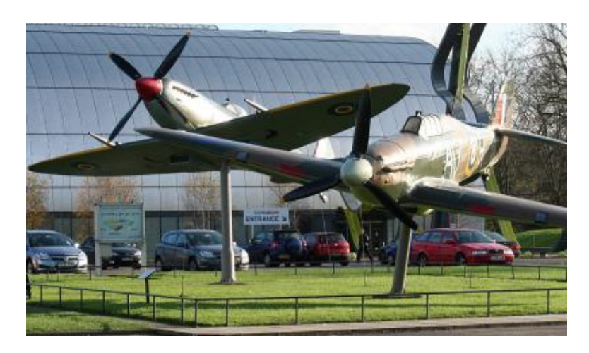
The RAF Museum Hendon, Grahame Park Way, London, NW9 5LL

The trip will depart from Hawkwell Fire Station, before proceeding to Billericay Fire Station with parking available at both sites. Coach collection times will be published later.